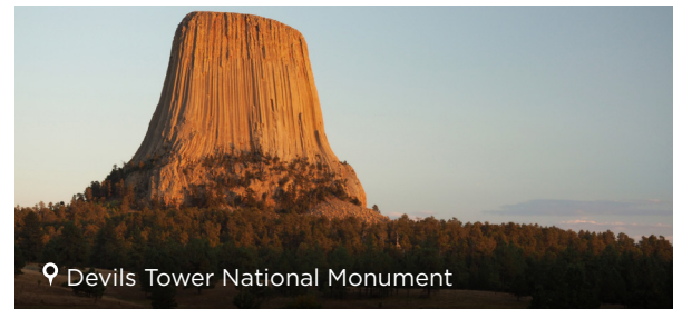
📍 Devils Tower National Monument