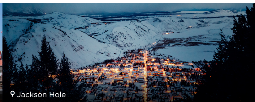
📍 Jackson Hole